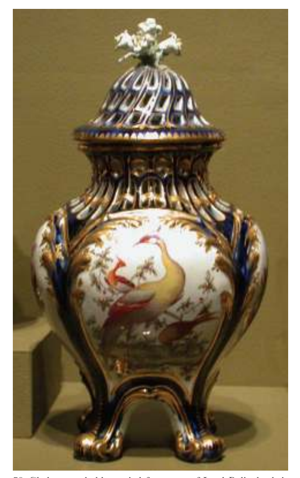
78. Chelsea, probably copied from one of Lord Bolingbroke's Vincennes vases, fig 77. Private collection

jour' (77), which corresponds to the 'deux pots pouris assortis, à quatre pieds don't les cartouches peints à oiseaux'. The word assortis indicates that they were similar to the previous entry, i.e. with a gros-bleu or bleu lapis ground, bought by Lord Bolingbroke in October 1755. This is the only Chelsea vase of this period copied exactly from a Vincennes original. A number of Chelsea examples with birds on a Mazarin-blue ground<sup>72</sup> (78) correspond exactly to the description of Bolingbroke's Vincennes vases, and since it is hard to imagine that another identically decorated pair of