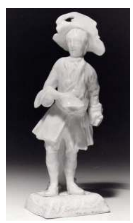
25. Bow Street trader, circa 1750