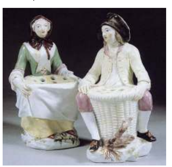
Chelsea figures modelled by Josef Willems, c. 1755.

Bellaigue in the Duchy of Cornwall accounts for 1733/34: it simply states 'The Dresden China £25.4' bought by Charles Lord Baltimore for H.R.H. (Frederick Prince of Wales) in France. A more substantial purchase was made in February 1742 of a