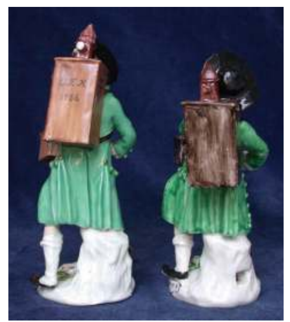
49b. the reverse of 49a