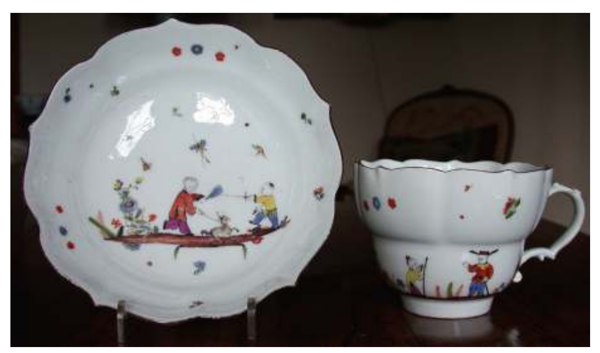
39. Meissen cup and saucer originally from Holland House with a 'glass-bonded' repair. Circa 1735.