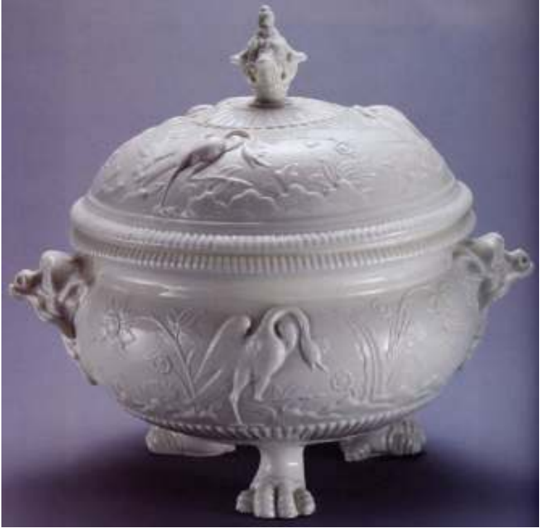
5. Saint Cloud tureen with mask handles, circa 1725, Musée des Arts Decoratifs