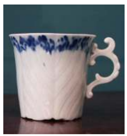
57. Worcester copy of fig. 56