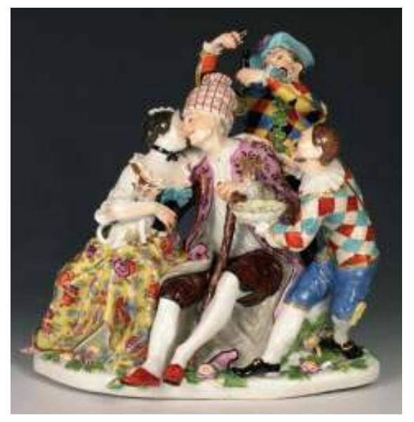
53. Meissen group of the 'Duped Invalid', by J. J. Kaendler, circa 1741