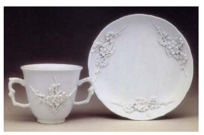
Bow beaker and saucer based on the Meissen form in fig. 29.

in exile, as he was engaged in the Jacobite rebellion of 1715 and charged with High Treason, but acquitted; or he may have ordered the set through a contact in the diplomatic corps. The form of the slender two-handled beakers, widely used at Meissen from the mid 1720s until about 1734/5, was copied at Bow (30) from the early 1750s and at Chelsea in the red anchor period.