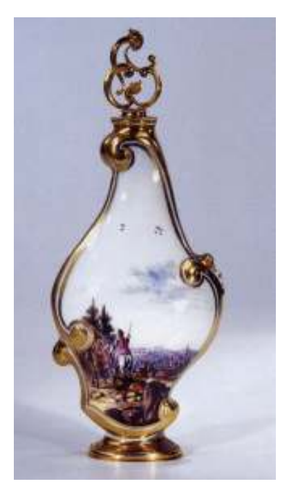
50. Meissen rococo scent bottle, circa 1745. The Rijksmuseum, Amsterdam