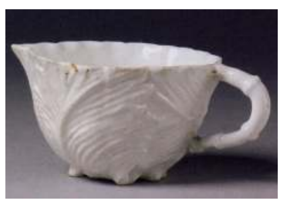
10. Chelsea Triangle Period copy of fig. 9, 1745-49