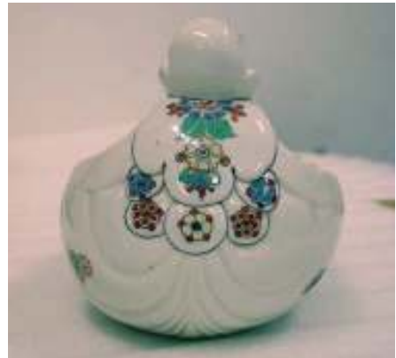
21. Back view of fig. 19

the 1760s. Further evidence of Chantilly porcelain in England is provided by a small cup and saucer, of a shape unique to Chantilly,<sup>9</sup> with London flower painting of c. 1760 and with a gilt 'Grubbe' border suggesting decoration in the studio of James Giles (22 & 23). That Giles had Chantilly porcelain can be seen from the advertisement for the sale by Squibb in the Daily Advertiser of the 26, 28/29 May 1777 'of The elegant and valuable Stock in trade of Mess. Giles and Higgins late of Cockspur-Street, Chinamen and Enamellers', which included 'Chauntilly' and other continental porcelain.<sup>10</sup>