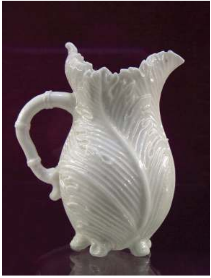
11. Chelsea triangle period, showing a development of the Chantilly original. Christie's, London