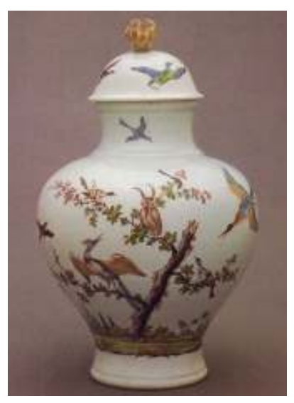
45. Worcester, circa 1756-58. Klepser collection

Meissen is evident in the letter of the 12th August 1751 from Sir Everard Fawkener. A Meissen version of a blanc de chine pomegranate teapot can be shown to have been in England in the mid 18th century as this example (46) has a silver spout and wooden handle of a type often added in England. The moulding of the leaves on the Chelsea example (47) are, if anything, closer to the Meissen than to the Chinese original (48),