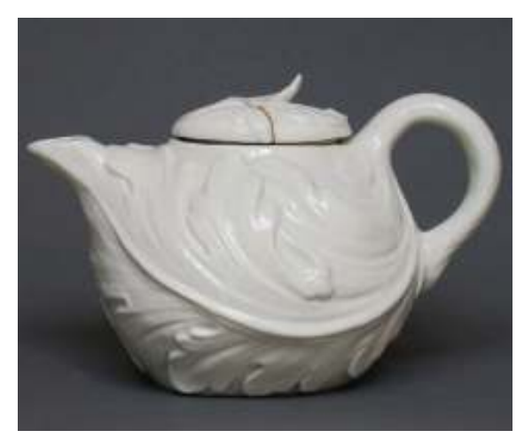
14. Chantilly leaf-moulded teapot, circa 1740

It is often hard to determine whether kakiemon designs in England were taken from Meissen, Chantilly or the Japanese originals, but sometimes it is possible and Chantilly was, for instance, evidently the source of the peach-shaped Lady-in-a-Pavilion cream jugs, as the closest prototype is Chantilly (16 & 17); the form was probably adapted from Chinese soapstone or bronze. A particularly good link between Chantilly and Bow is an early sauceboat<sup>8</sup> of which only two Bow examples are recorded, one in the British Museum with the 'arrow and annulet mark' (Franks Collection I.48) (18),