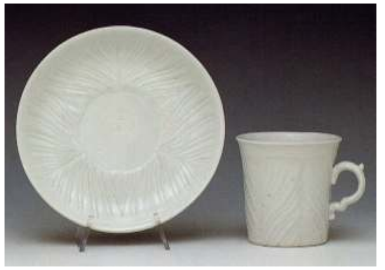
56. Doccia, circa 1745