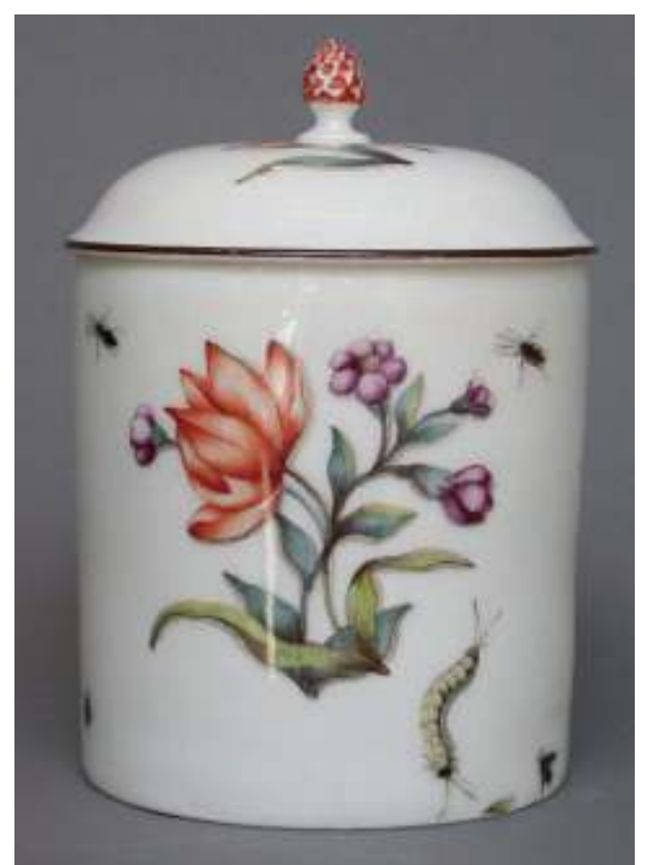
62. Meissen tobacco jar with holszchnit blumen, circa 1735

Errol Manners - Some Continental Influences on English Porcelain