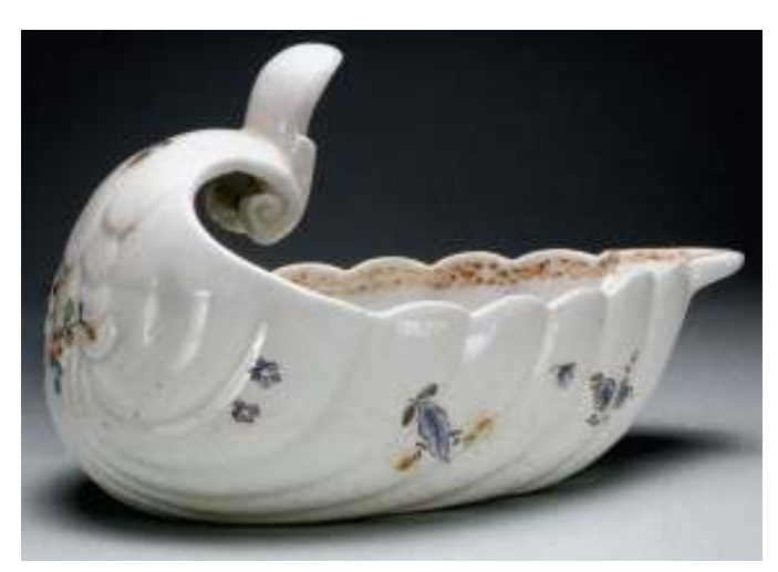
18. Bow sauceboat, circa 1750.