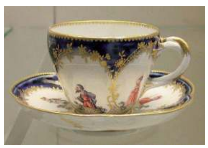
70. Chelsea of the same form, gobelet Hébert, as purchased by Lord Bolingbroke, see fig 69

(77). In September 1756 Duvaux sold him his most substantial purchase, a bleu céleste dessert service comprising 48 plates and various compotiers, fromagers and seaux as well as a centre-piece on an ormolu and mirror stand<sup>63</sup> and four vase 'pot pourri Pompadour', of the third size, blue ground with monochrome children. A pair of these are probably the examples in the J. Paul Getty Museum (71).64 Some of the plates survive in the Royal Collection<sup>65</sup> and the centre-piece in the Cholmondeley collection at Houghton. This purchase is remarkable, as no other service of this size had yet been bought by anyone other than the King or Madame de Pompadour. 'Bully' Bolingbroke