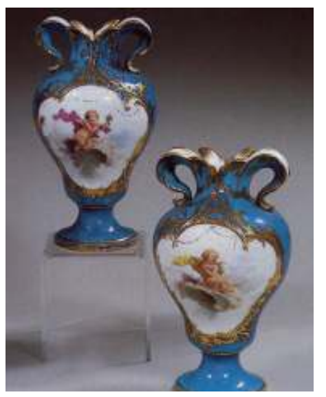
74. Vincennes vases à oreilles, probably bought by Augustus Hervey in 1755. Paris art market.