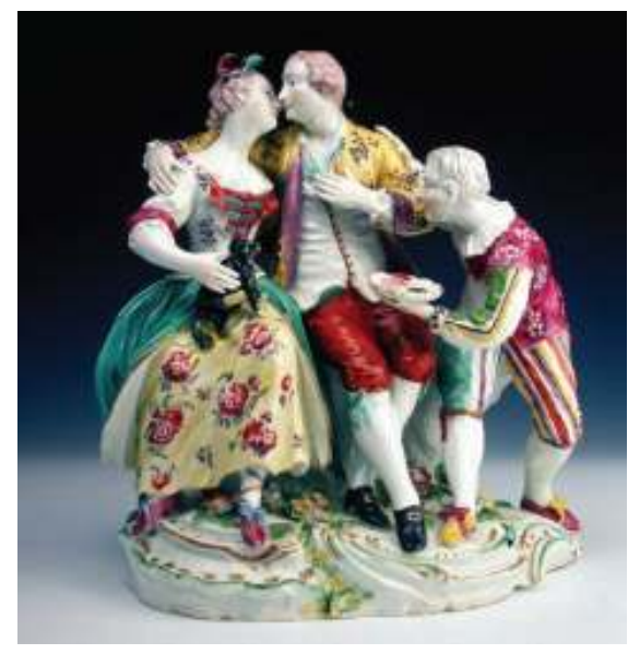
54. Derby adaption of fig. 53 of circa 1760