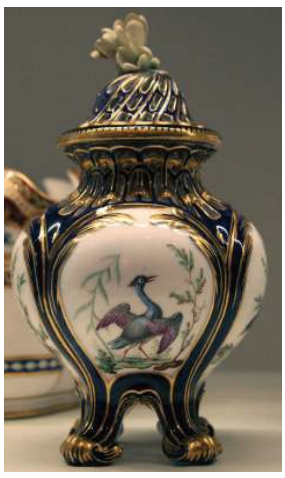
Vincennes pot pourri à jour, probably one of the pair bought by Lord Bolingbroke in 1755. Musée des Arts Decoratifs, Paris