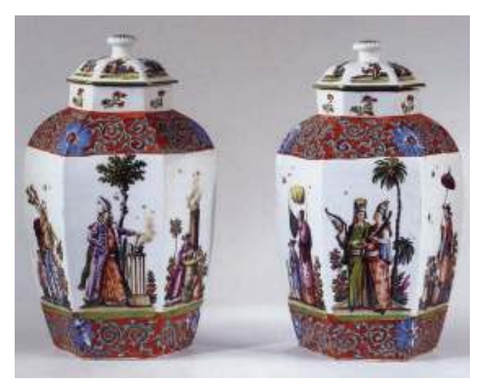
41. Meissen, circa 1745, The Rijksmuseum, Amsterdam