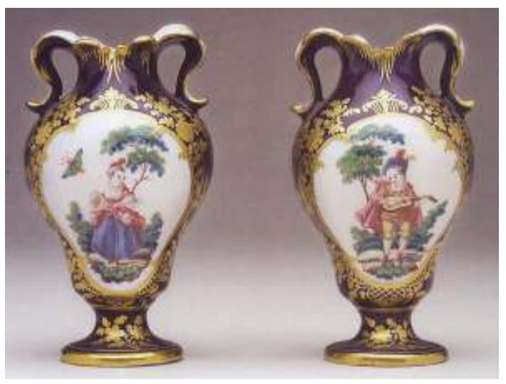
75. English vases of the same form as fig. 74, attributed to Vauxhall or Bow, painted in the studio of James Giles. Private collection