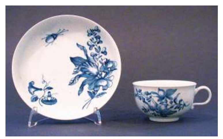
Worcester cup and saucer copying a Meissen form and decoration and marked with 'crossed swords', circa 1760

Worcester is remarkable amongst the major English factories, and it is a tribute to its originality, exhibiting scarcely any direct influence of Meissen in its early years up to the later 1750s, in spite of Richard Holdship later describing it as a "Porcelain manufactory in imitation of Dresden ware". I can find no form and little decoration copied directly before about 1756. One of the few instances that perhaps indicates a familiarity with Meissen is a coffee pot of around 1752-53, from the A. J. Smith collection in the Bristol Museum which is enamelled with a type of bold oriental floral pattern probably derived from that found on Meissen.<sup>43</sup> We have seen, in the vase (45), how some Meissen was copied via the intermediary of Chelsea, but by about 1760 direct copies can be found, such as the blue and white cup and saucer (52), which copies the form and decoration precisely as well as including the famous crossed-swords mark.