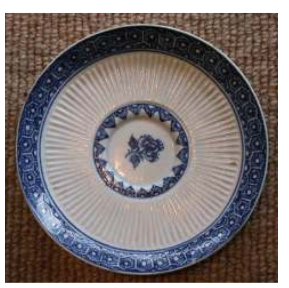
4. Bow after a Saint Cloud original, circa 1760