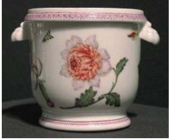
Vincennes seau, circa 1748, with flower painting derived from Meissen holszchnit blumen.