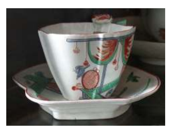
16. Chantilly peach-shaped cup painted with the 'Lady-in-a-pavillion' pattern, circa 1735

It is often hard to determine whether kakiemon designs in England were taken from Meissen, Chantilly or the Japanese originals, but sometimes it is possible and Chantilly was, for instance, evidently the source of the peach-shaped Lady-in-a-Pavilion cream jugs, as the closest prototype is Chantilly (16 & 17); the form was probably adapted from Chinese soapstone or bronze. A particularly good link between Chantilly and Bow is an early sauceboat<sup>8</sup> of which only two Bow examples are recorded, one in the British Museum with the 'arrow and annulet mark' (Franks Collection I.48) (18),