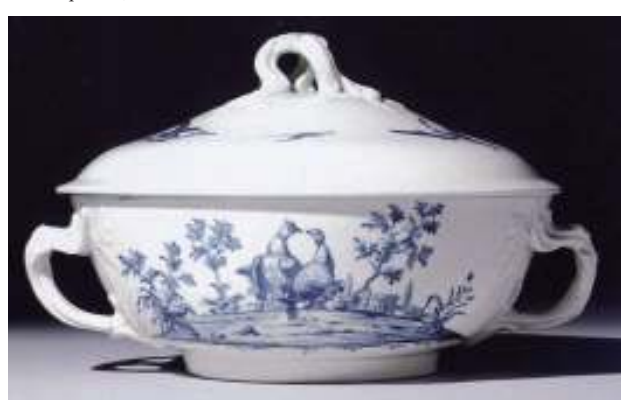
Worcester, circa 1756-8 probably copying Chelsea rather than the Vincennes original.