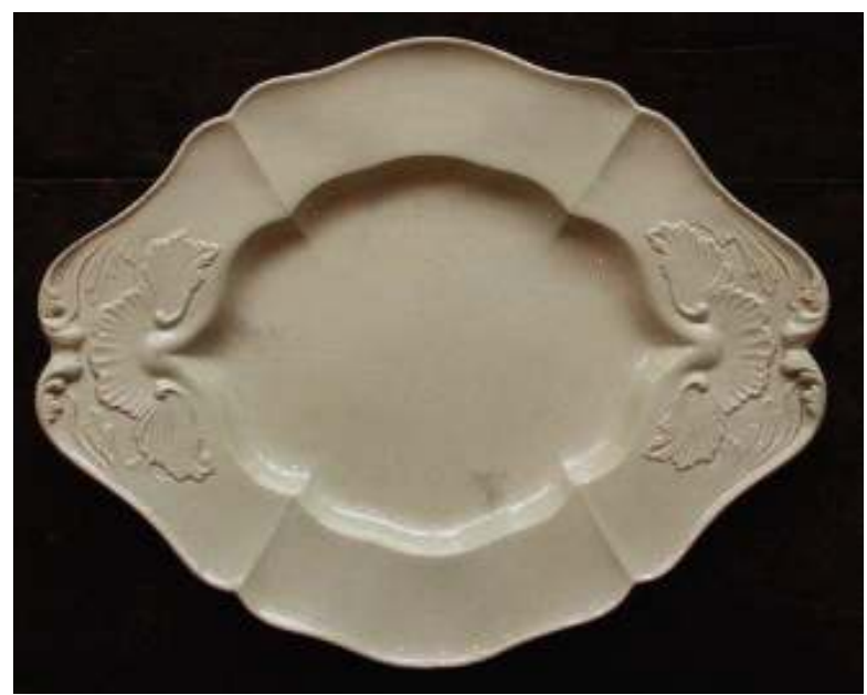
80. Wedgwood tureen stand copied from the Bedford service

79. Sèvres tureen from the service presented to Gertrude, Duchess of Bedford in 1763. Woburn Abbey