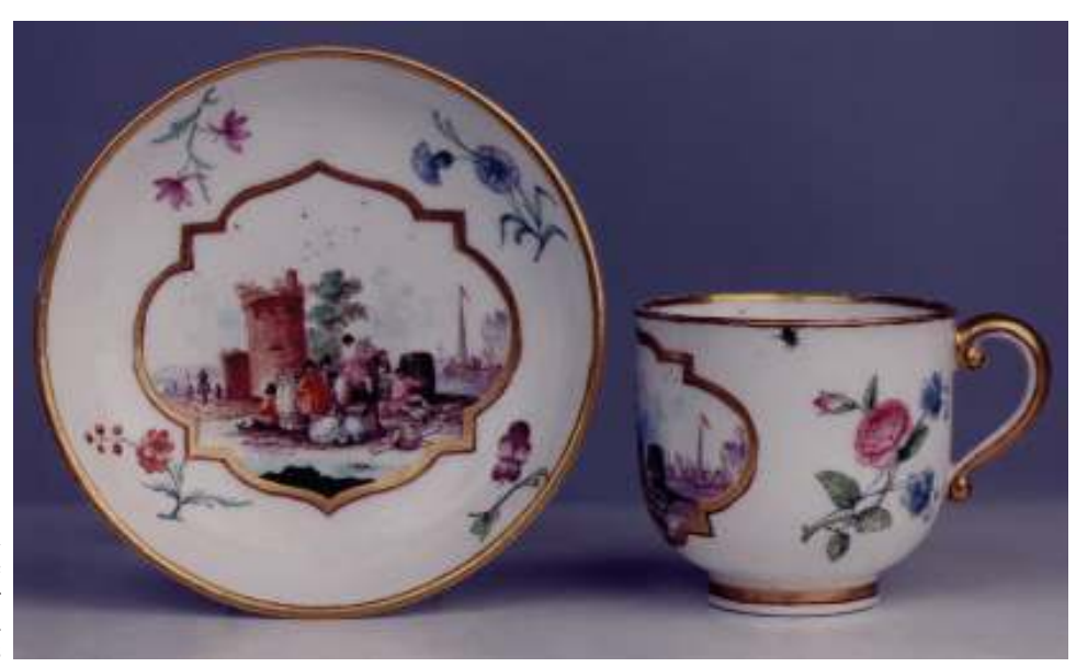
63. Vincennes with Meissen style harbour scenes, circa 1745-48

Tim Clarke noted the similarity of flower painting on certain pieces of Triangle period Chelsea (1745-49) with that of Vincennes of around 1745-48; this, in turn, was taken from the Meissen holszchnit blumen or wood-cut flowers that were used around 1735-40. It is difficult to be certain that Chelsea was in fact copying the very rare early Vincennes examples or the much more common Meissen pieces (60, 61, 62), but since contact with Paris was easier and much more frequent than with Dresden it is entirely plausible that Vincennes was then more readily available. It is also notable that there are no signs of Meissen forms in Chelsea of the Triangle period whereas some of the simpler Vincennes shapes are found such as the gobelet lizonnée. Likewise perhaps Chelsea copied its rare use of harbour scenes from the scarce Vincennes pieces rather than Meissen (63 & 64). From around 1750 the direct influence of Meissen is more apparent.