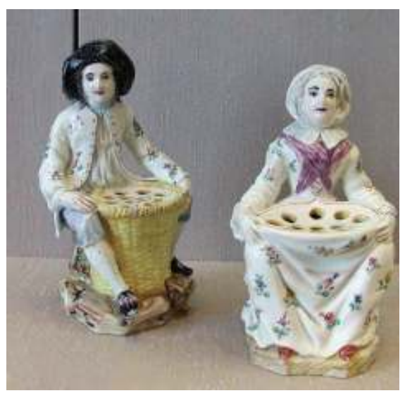
26. Mennecy bouquetière figures, incised 'DV' mark.

The obvious place to look for early examples of Meissen porcelain in England is in the Royal Collection, but surprisingly none exists with a secure provenance from the first half of the 18th century. George I's mother, The Electress Sophia of Hanover, had one of the earliest Meissen armorial tea services<sup>13</sup> dating from c. 1713/14 (28), and other early pieces with a provenance from the House of Hanover, where George II spent each summer, are known.<sup>14</sup> An ecuelle, cover and stand in the British Museum was probably made for his daughter, Sophia Dorothea, wife of Frederick William of Prussia in about 1735. Whilst Augustus the Strong's conversion to Catholicism precluded any dynastic links between the court at Dresden and the Hanoverians, this did not prevent Meissen from being presented to other protestant monarchs such as those of Denmark and Sweden.<sup>15</sup> The earliest record of Meissen in the British Royal Collection was found by Sir Geoffrey de