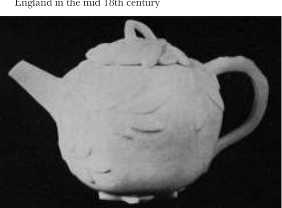
47. Chelsea teapot of the Raised anchor period that appears to be copied from the Meissen rather than the Chinese original, fig 48