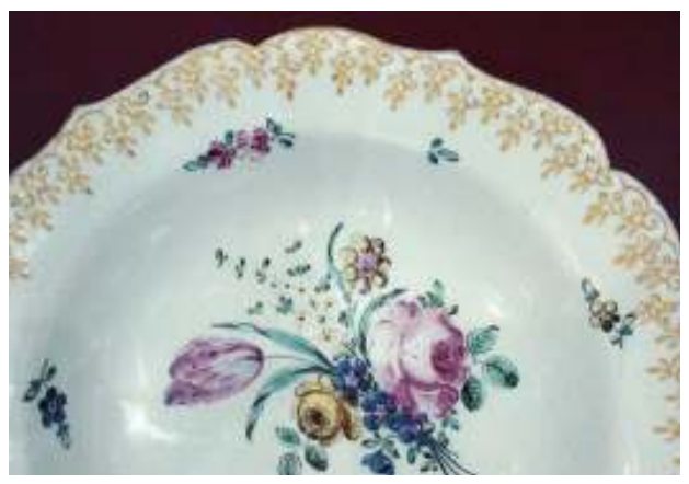
23. Detail of fig. 22, showing a gilt border of the type found on the Grubbe plates suggesting decoration in the studio of James Giles

22. Chantilly cup and saucer decorated in London, circa 1760.