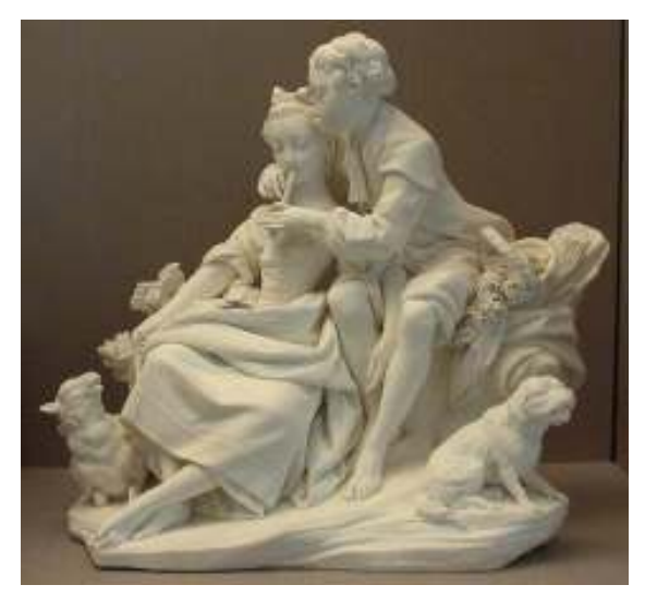
82. Vincennes biscuit group of 'L'agréable leçon', circa 1753