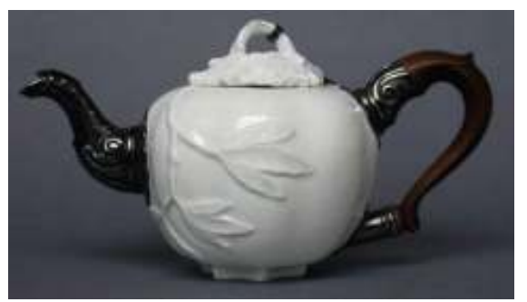
46. Meissen teapot, circa 1740, with handle and spout added in England in the mid 18th century

Meissen is evident in the letter of the 12th August 1751 from Sir Everard Fawkener. A Meissen version of a blanc de chine pomegranate teapot can be shown to have been in England in the mid 18th century as this example (46) has a silver spout and wooden handle of a type often added in England. The moulding of the leaves on the Chelsea example (47) are, if anything, closer to the Meissen than to the Chinese original (48),