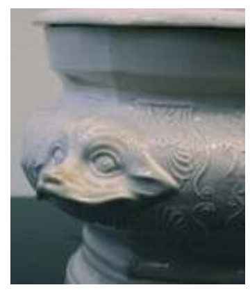
8. Detail of the handle of fig. 6

In the "Liste de porcelaine recue de sa Grandeur la Duchesse de Richmond le 25 Juin 1739 a Londres par Fr. Lefevre" (apparently a household servant) Chantilly porcelain is described in three rooms in the London, presumably, Whitehall, residence of the Duke of Richmond: