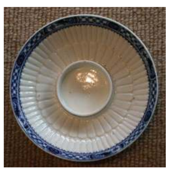
3. Saint Cloud blue and white gadrooned saucer, circa 1740.