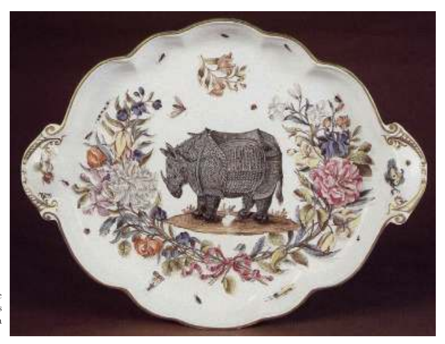
33. Meissen tray from the service given to Sir Charles Hanbury Williams, circa 1747, Alnwick Castle

It is curious that Sir Charles received quite such a very splendid gift, as England had not been central to the diplomatic concerns of Saxony, but the Treaty of Warsaw in January 1745 secured the pecuniary support of the Maritime Powers for the Austro-Saxon alliance.<sup>29</sup> Within the shifting diplomatic alliances of this period Sir Charles's main contribution was probably the negotiation of a large loan to a nearbankrupt Saxony. It is possible that the service was part of a 'back-hander' from the rapacious and corrupt Count Brühl, with whom he had formed a close association; corruption and financial self-interest were an unspoken but tacitly accepted part of public life. He apparently had always intended to sell it, as was common practice with diplomatic gifts, as he wrote, in 1748, to Henry Fox: 'it would cost here fifteen hundred pounds. I wish anyone would give so much for it in England'.