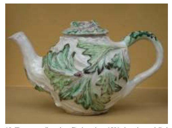
Teapot attributed to Derby, circa 1750, loosely modelled on a Chantilly or Chelsea original.

and the other from The Museum of Fine Arts, Boston ( Katz Collection ). The Chantilly example is equally rare, I only know of two examples; one in the Musée des Arts Decoratif, Paris (19), and the other in the Musée National Adrien Dubouché, Limoges. The Bow examples date from about 1750 or just before; those of Chantilly from 1735-40. The correspondence is almost exact (20 & 21).