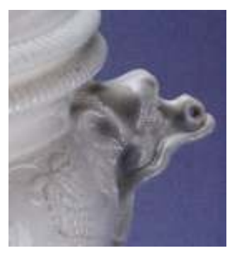
7. Detail of the handle of fig. 5