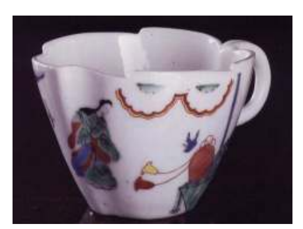
17. Chelsea version of fig 16, Raised Anchor period

Chantilly, or perhaps Dutch Delft, seems to have supplied the idea of the butter tubs with cow finials found at Worcester and in salt-glazed stoneware in