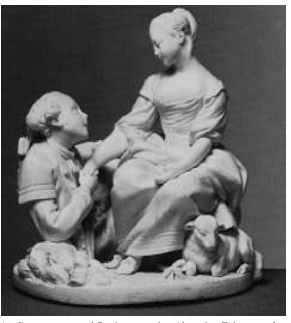
84. Sèvres group of La bergère des Alpes by Falconet after Boucher, circa 1766