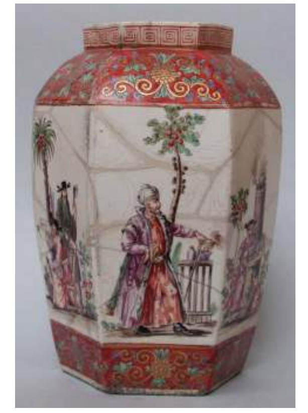
42 a & b. Two views of a Chelsea vase, circa 1756, copied exactly from the Meissen example, fig 41. The Victoria and Albert Museum