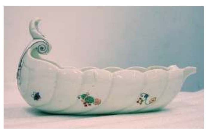
19. Chantilly sauceboat, circa 1735, Musée des Arts Decoratifs, Paris