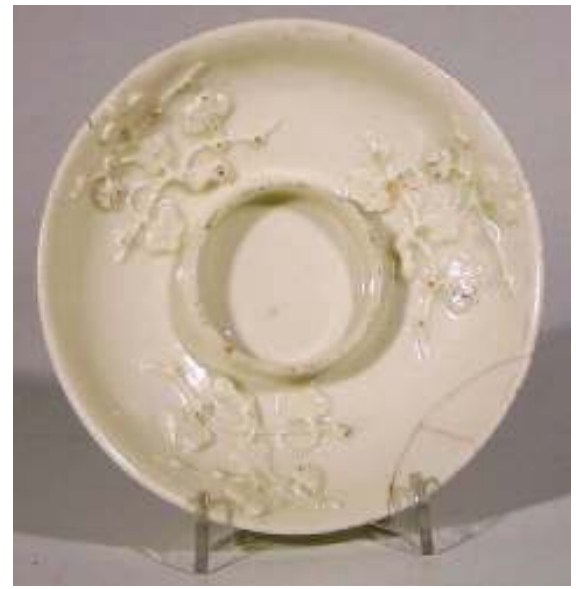
2. Bow saucer after a Saint Cloud original, circa 1755