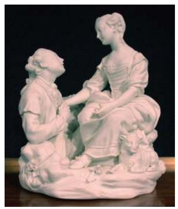
85. A Derby version of fig. 84 taken directly from the Sèvres