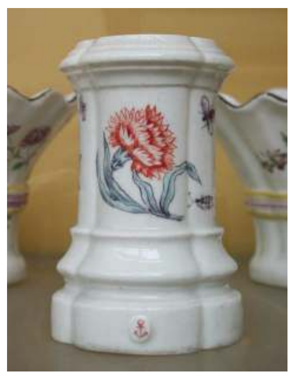
60. Chelsea pedestal, raised Anchor period, with stylised flowers probably copied from Vincennes

We know from the memoirs of the duc de Luynes in 1749 that 'Les Anglais ne demandent que de la porcelaine toute blanche, mais comme ils pourroient en faire usage pour y ajouter des peintures, en leur vend cette porcelaine blanche aussi chère que si elle etait peinte', which indicates that some Vincennes porcelain had already been acquired by English buyers before this date.<sup>54</sup> This date is important, as it