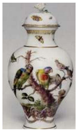
43. Meissen vase, circa 1745. Schloss Lustheim