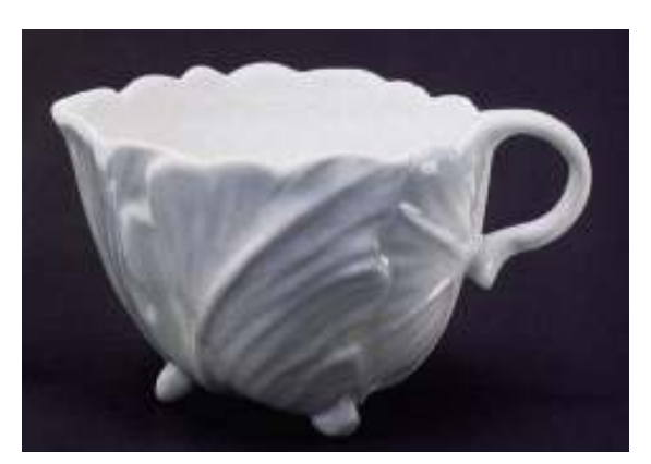
9. Chantilly a canthus-moulded cream jug, circa 1740\,