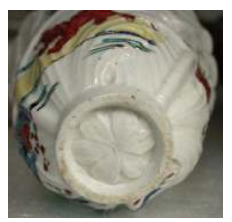
13. Footring of a Chelsea beaker of the Triangle period