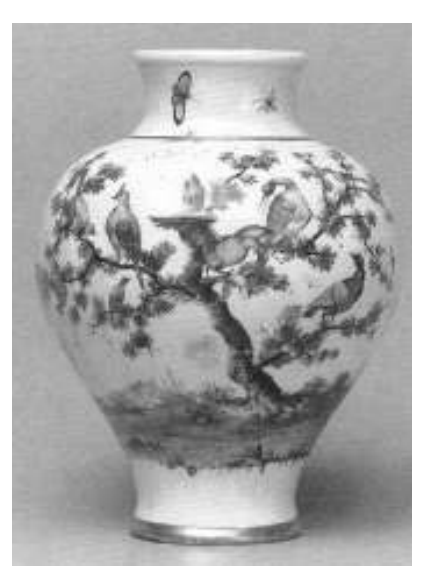
44. Chelsea, circa 1756