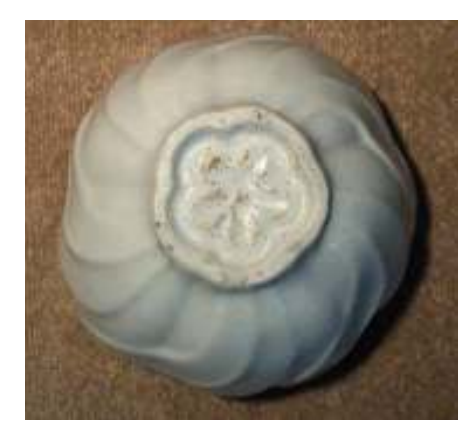
12. Footring of a Chantilly teabowl, circa 1740