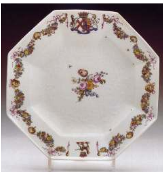
36. A plate with the arms of Fitzgerald and Lennox probably commissioned by Henry Fox, circa 1750. The Hoffmeister Collection, Hamburg

Errol Manners - Some Continental Influences on English Porcelain