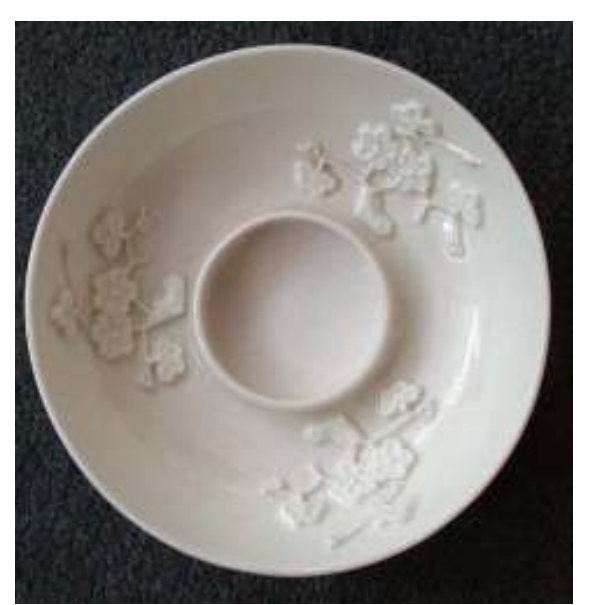
1. Saint Cloud prunus moulded trembleuse saucer, circa 1730

The régence style of the finest early Saint-Cloud was hardly a satisfactory source for the most fashionable wares of the early English factories, but influence can be seen in the simpler prunus patterns with moulded trembleuse saucers at Bow and at Chelsea<sup>5</sup> of the raised anchor period, in the gadrooning popular at Bow, Longton Hall and Worcester into the 1760s (1-4), and particularly on knife hafts and cane handles.