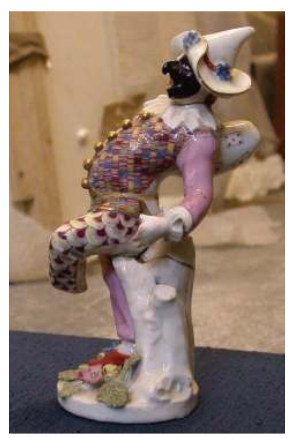
38. Chelsea figure of Pulcinello, after a Meissen original, rescued from the ruins of Holland House after World War II.

about 1770. A very rare Chelsea figure of Pulcinello (38) after the Meissen model by J.J. Kändler was rescued from the ruins of Holland House after it was bombed in the War. Perhaps some of the Chelsea copies were sent to Holland House in gratitude for the help that they had been given. The porcelain remaining at Holland House does not necessarily reflect what was there in the 1750s, as, for instance, the Bow Harlequin was clearly added long after the period of the Dresden exchanges; and Caroline Fox was buying porcelain avidly in the late 1750s and 60s. In a letter to her sister Emily in 1759 she writes: 'I hope Lord Kildare has made a good report of my blue gallery and my dressing room fitted up with a