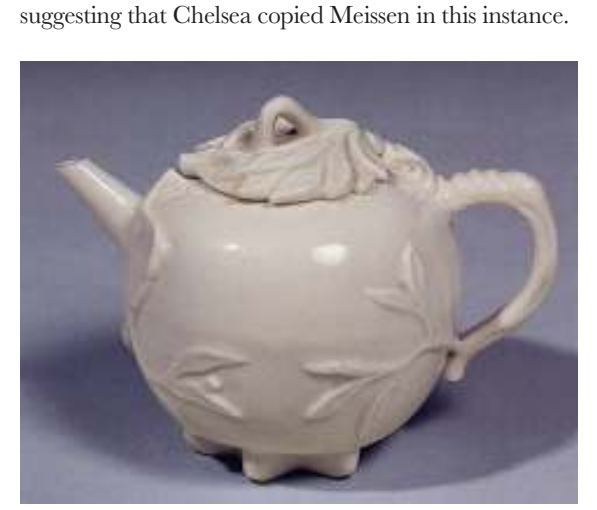
48. Chinese teapot, Dehua, Kangxi period