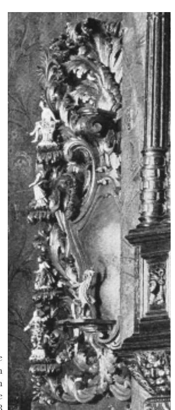
37. Photograph of some of the porcelain remaining in Holland House taken in 1908

Photographs taken of the interior of Holland House (37) show a small part of the collection<sup>32</sup> as it was before 1908 including an example of the Monkey band leader or a Chelsea copy (a model first recorded in the 1756 sale catalogue), a figure of Harlequin from the Commedia dell'arte which is probably an English copy of the rather small Meissen figure from the series made for the Duke of Weissenfels and a Bow Harlequin of the 'Anchor and Dagger' period of