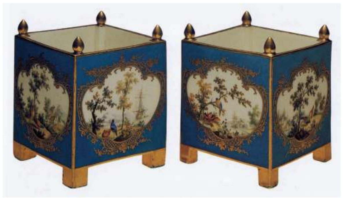
73. Vincennes caisse carrées painted by Armand ainé with birds and 'men o' war', bought by Augustus Hervey in 1755. Carnegie Museum of Art, Pittsburgh